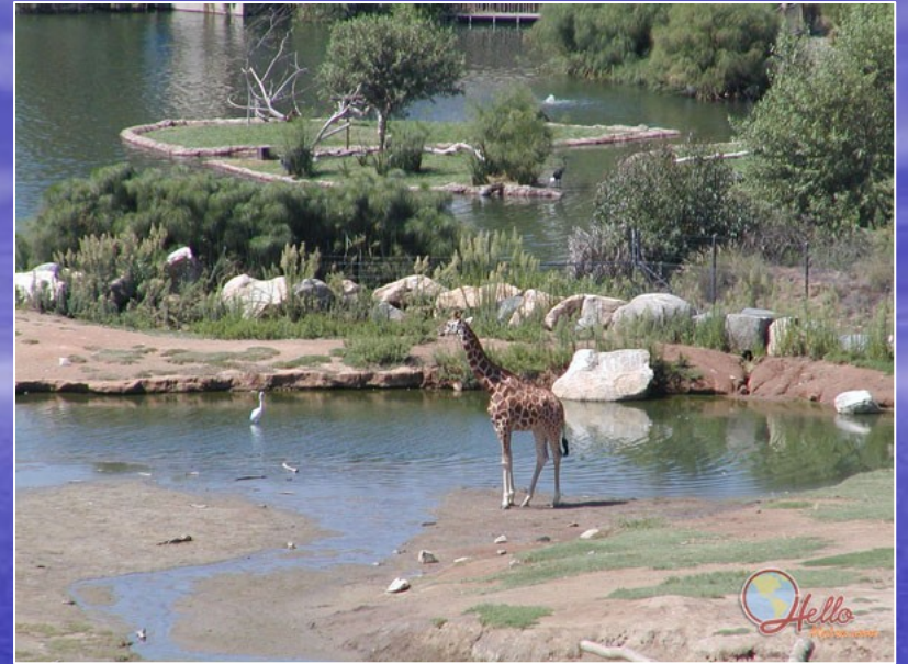
San Diego Wild Animal Park (80 miles)