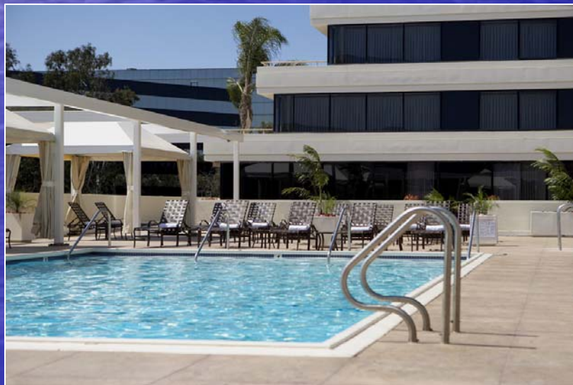
Fairmont Roof-top Swimming Pool