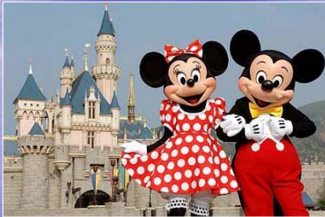
Disneyland (20 miles away)