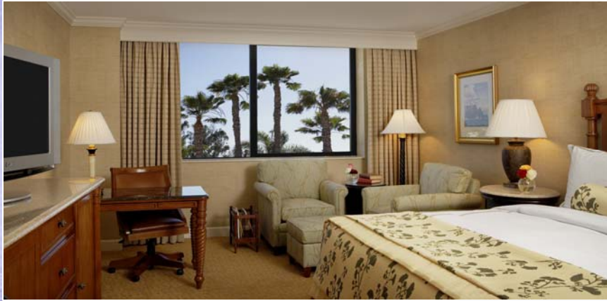
Fairmont room with a flat panel TV