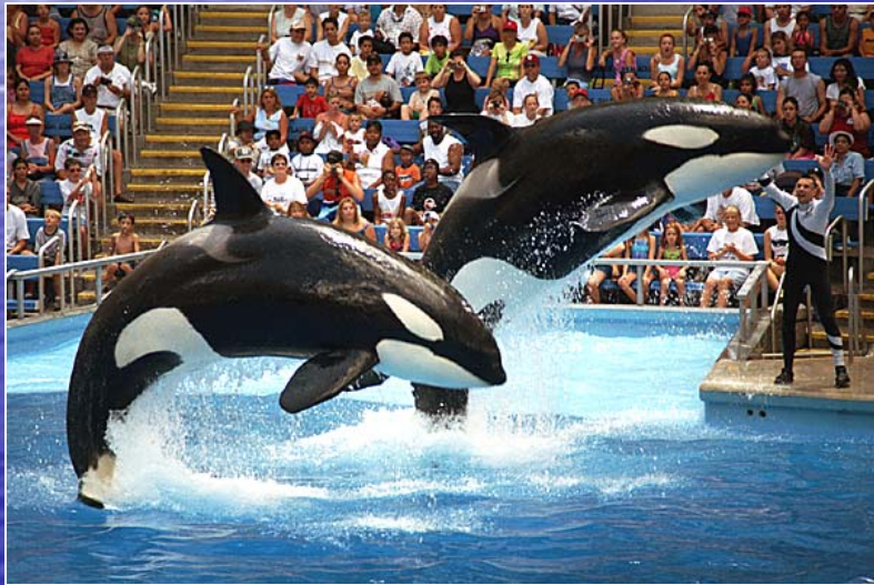
Sea World (80 miles away)