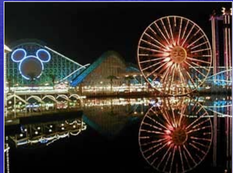
Disney California Adventure (20 miles)