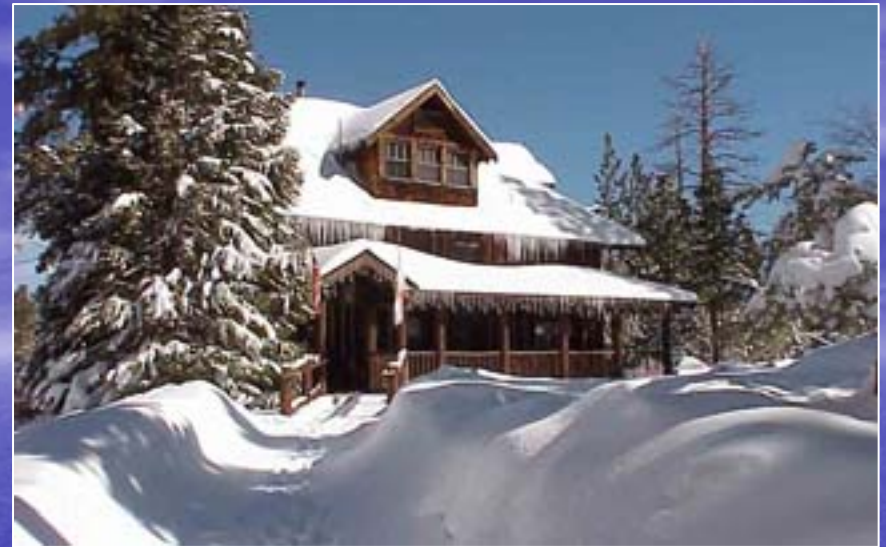
Ski Resort Big Bear Lake on San Bernardino