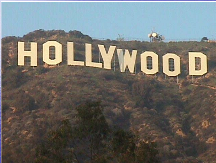
Hollywood (50 miles away)