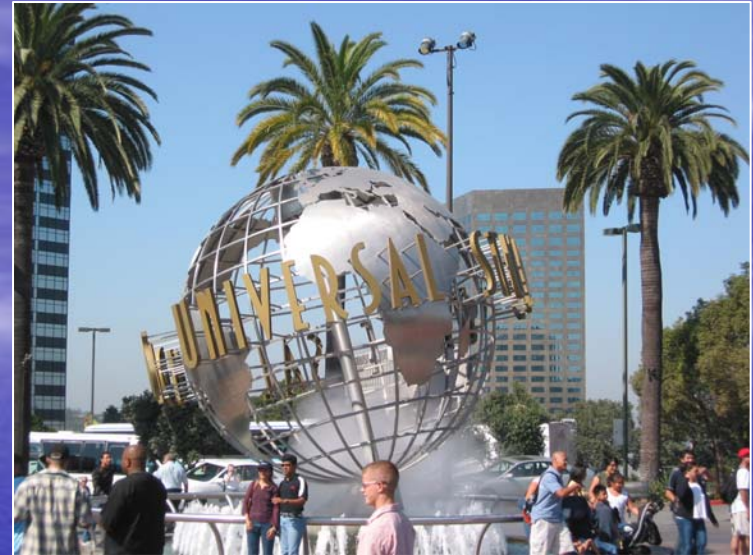
Universal Studios (50 miles away)