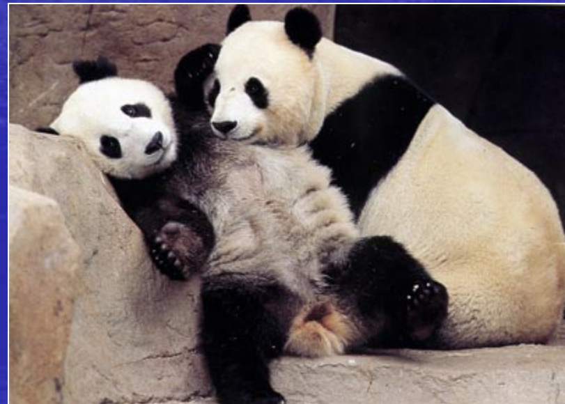
San Diego Zoo (80 miles away)