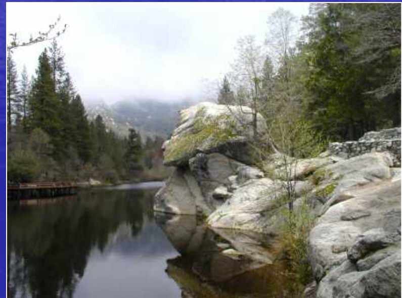
Mountain Resort Idyllwild on San Bernardino