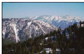
San Bernardino Mountains