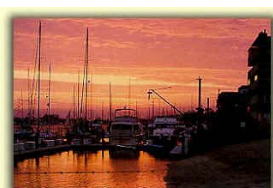
Newport Beach Harbor