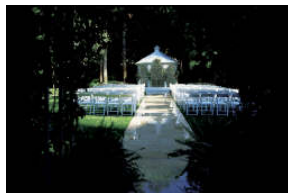
Reception Venue in Fairmont