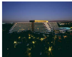
Bird's Eye View of Fairmont

VRST 2007 will take place in the Fairmont Newport Beach Hotel from Monday, November 5 th to Wednesday, November 7 th , 2007.