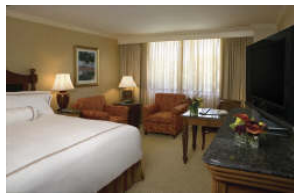
Standard Room in Fairmont